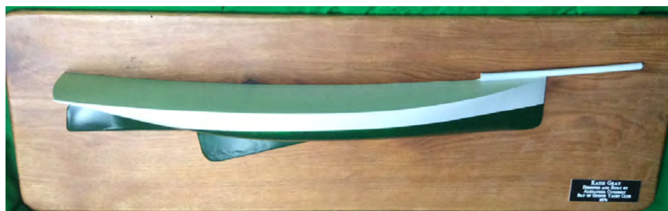
L: Katie Gray Half Model Below: Katie Gray 50 Trophy