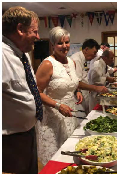
Above: A fine feast fit for a fleet