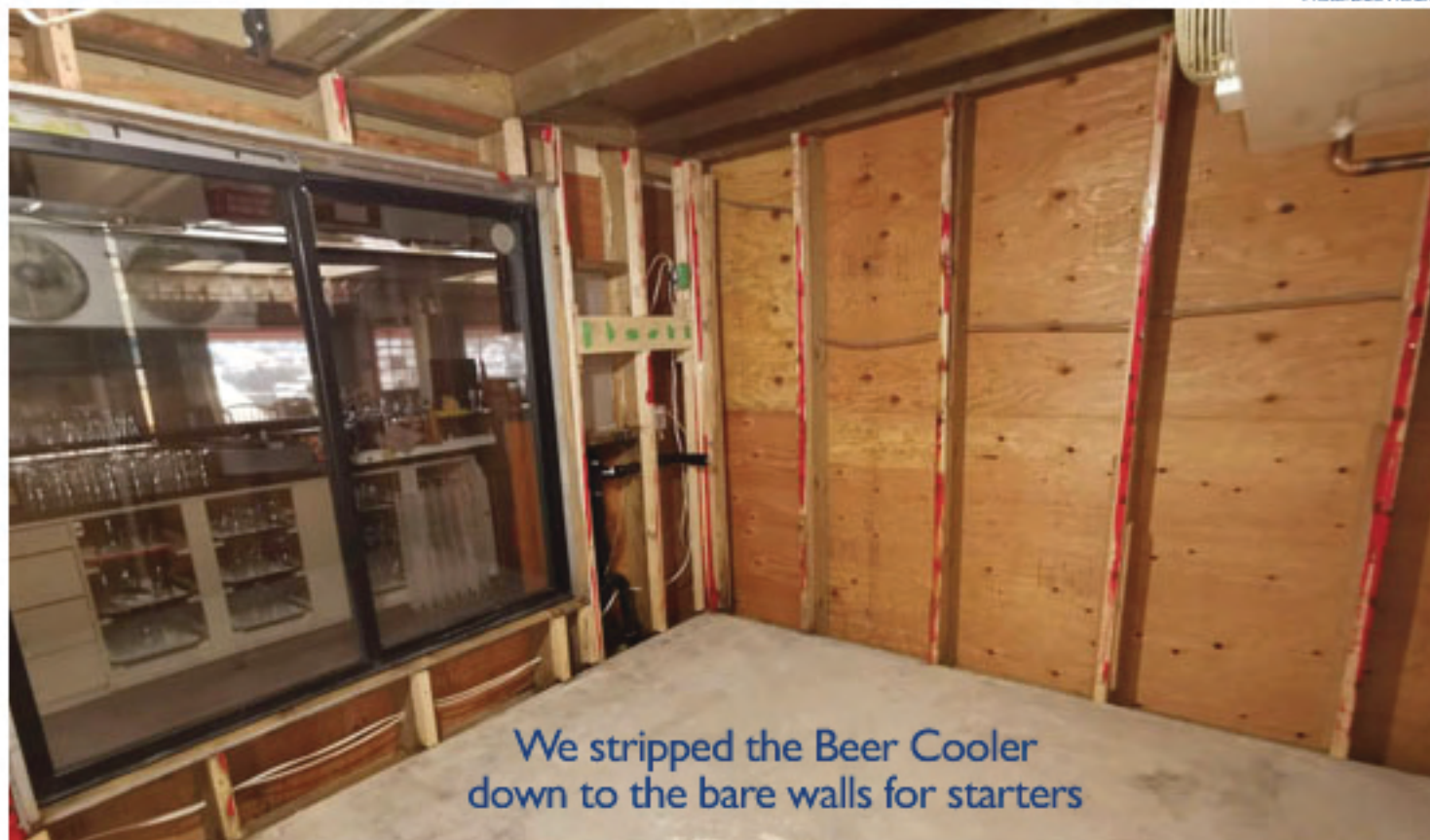
We stripped the Beer Cooler down to the bare walls for starters