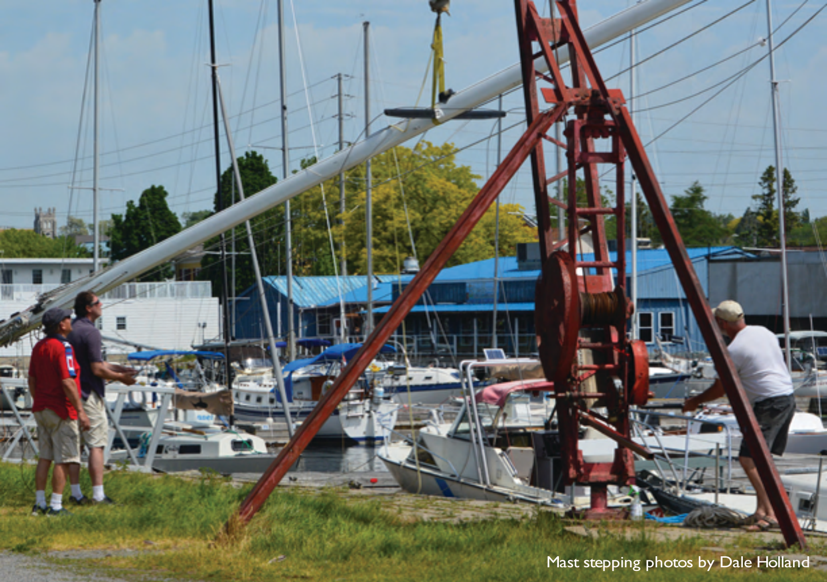
Mast stepping