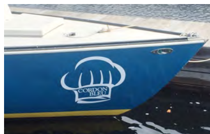
Cordon Bleu (Jean-Marc Salvagno)