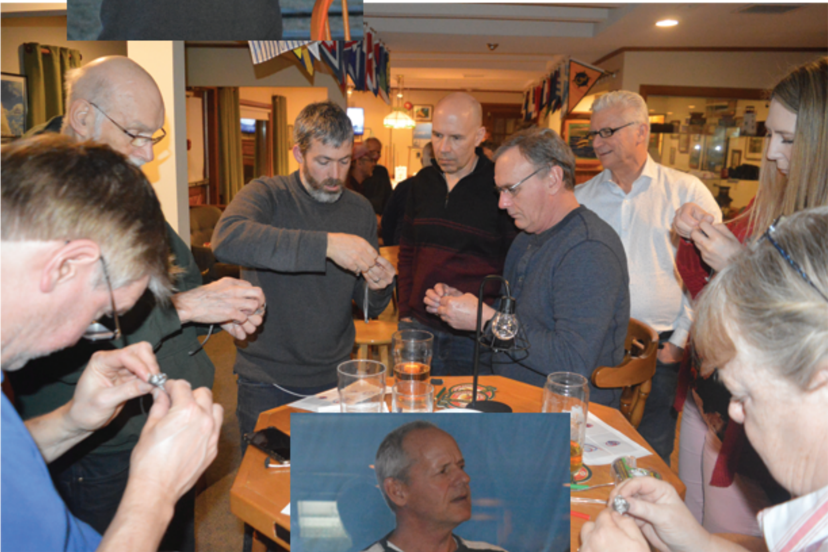
This talented group tried hard to get into the delicate operation. It was discovered that beverages helped reduce the stress of the operation immensely.